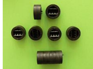
Figure #3 GXR-P doublet ME