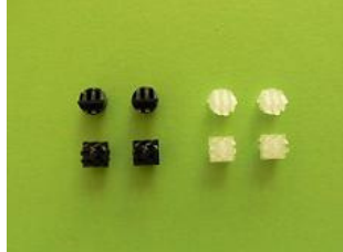
Figure #2 GXP mixing elements