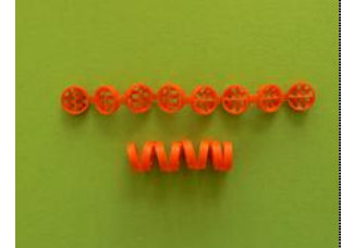
Figure #4 GXF 8-rings chain un- folded and folded to one GXF-ME