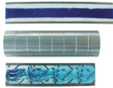
Mixing of epoxy resins in an empty pipe and in an mixer LMXR