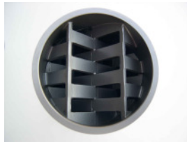
Mixing element LMXR (licensee of BAYER AG)